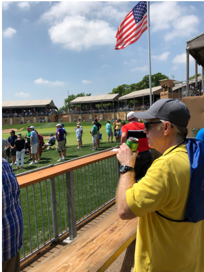
It's All About The Beer (Karbach sponsored post)